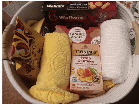
Gift Basket for Raffle