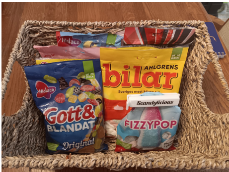
Swedish Candy Gift Basket

Jim Goodwin Edmund Lodge #91 Correspondent