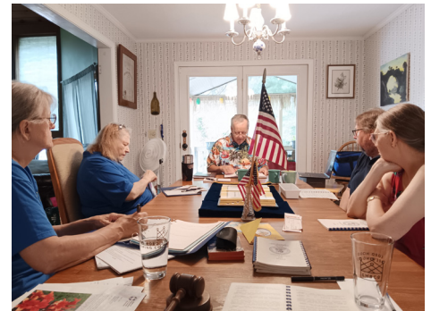
Edmund Business Meeting