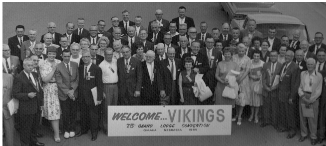
Delegates at the 1965 Convention in Omaha, Nebraska

Non-delegate members do not vote on the official business of the order, but they are welcome to attend business meetings and get a better sense of how the organization is run. Feel free to reach out to Executive Council members or past grand chiefs if you'd like to know more. We hope to see you there!