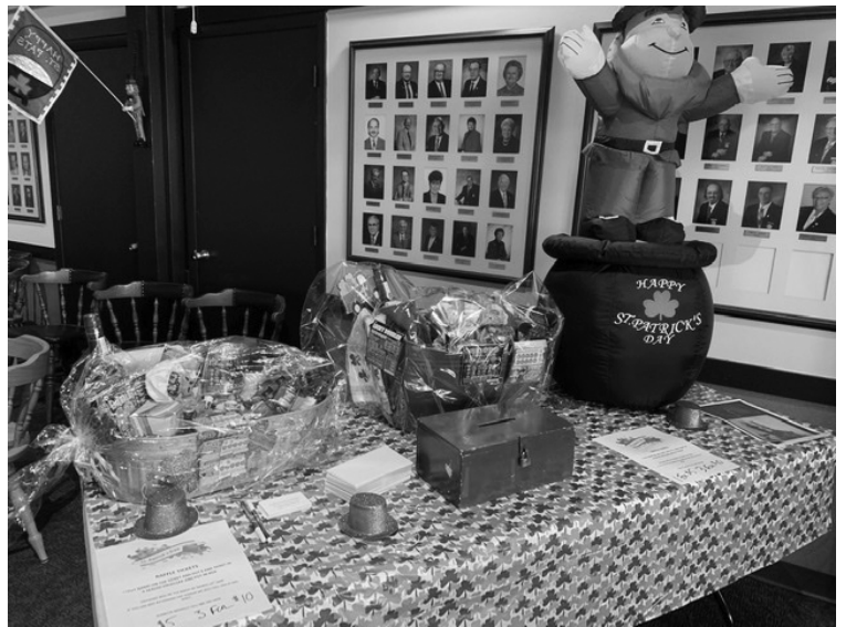
St. Patrick's Day