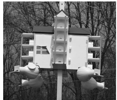
Pictured above: Ed Pace erecting upgraded purple martin nesting houses.